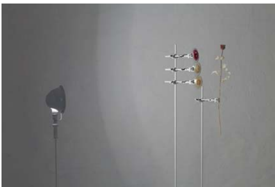
Elsa Salonen Study of Eternal Cycle, 2014 Three rounded laboratory glasses, extracted pigments of rose, metal rack, light, rose Dimensions variable

Courtesy and © The Artist and Gallery Heike Strelow