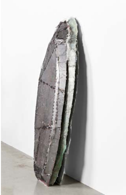
Tiril Hasselknippe Untitled (green), 2014 Steel, polyester, glass fiber, pigment 194 x 68 x 9 cm