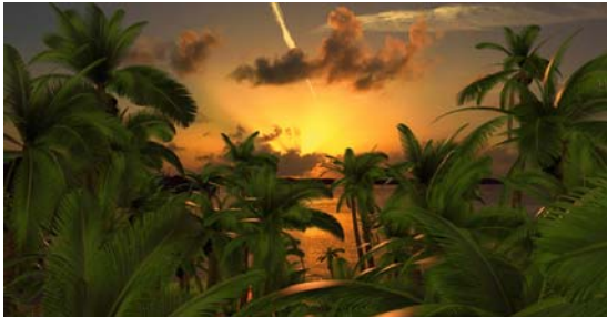
Mathias Kessler Sunset in Simulacrum_03, 2014 3D Computer Rendering