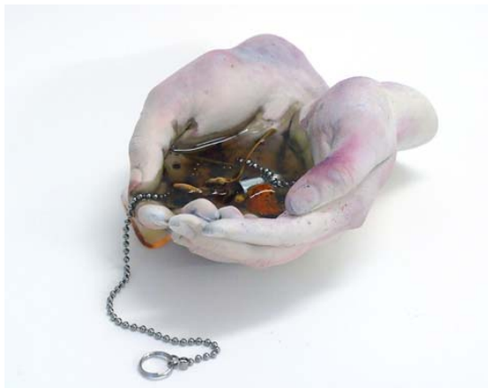
Mia Goyette Pro tempore (drain), 2016 Pigmented cast plaster, epoxy resin, chained drain stopper, orange peel, dead plants, various debris about 19 x 12 x 9 cm