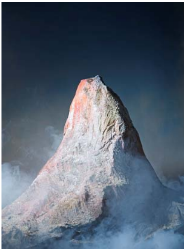
Andreas Wißkirchen Such Great Heights, 2014 Inkjet Print, framed 192,49 x 150 cm