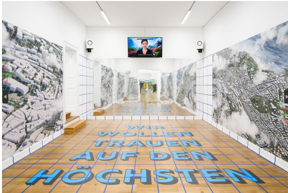
Cemile Sahin / Gewehr im Schrank – Rifle in the closet, 2023 Multimedia installation Courtesy of the artist and Esther Schipper Berlin / Paris / Seoul