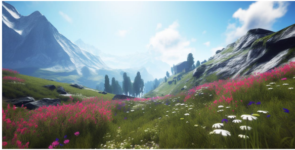
Cemile Sahin Gewehr im Schrank - Rifle in the closet, 2023

Please consider the copyright. The use of the images in connection with the news coverage of the exhibition is permitted. We will gladly provide you with the requested pictures in printable solution. In return, we look forward to receiving a specimen copy/document link.