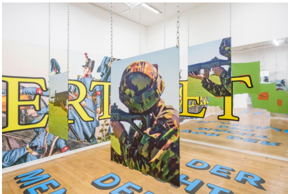
Cemile Sahin / Gewehr im Schrank – Rifle in the closet, 2023 Multimedia installation Courtesy of the artist and Esther Schipper Berlin / Paris / Seoul