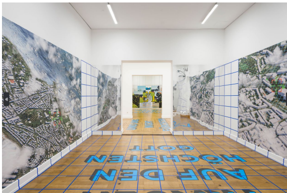
Cemile Sahin / Gewehr im Schrank – Rifle in the closet, 2023 Multimedia installation