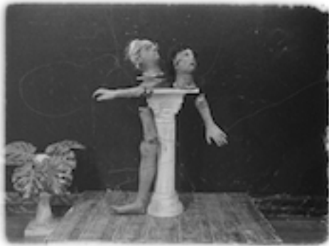
Joaquín Cociña & Cristóbal León / Los Huesos (2021)