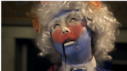
Rachel Maclean The Lion and The Unicorn , video still, 2012 12-minute digital video Commissioned by The Edinburgh Printmakers for Reflective Histories ,