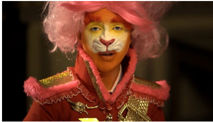
Rachel Maclean The Lion and The Unicorn , video still, 2012 12-minute digital video Commissioned by The Edinburgh Printmakers for Reflective Histories ,

Please respect the copyright. There is no charge when used in reports on the exhibition. On request we can provide images in a printable resolution. In return we would be pleased to receive a copy and /or document link of your article.